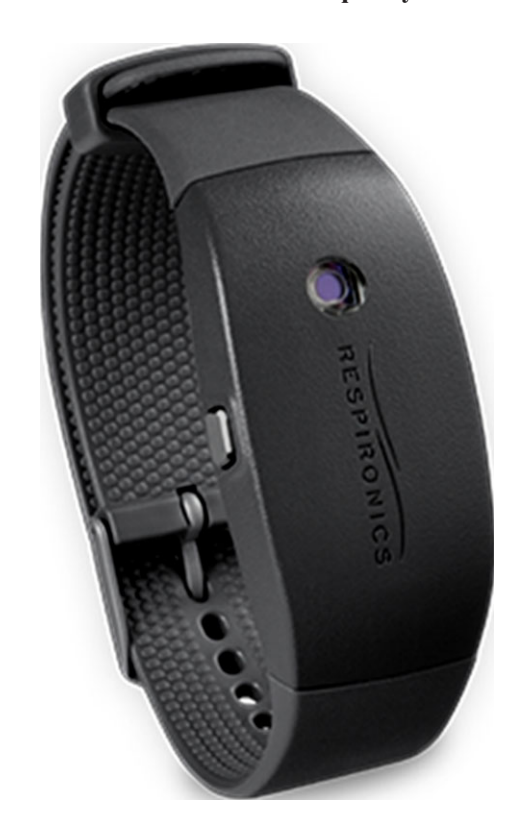
Fig. 1 Philips Actiwatch 2

During the two experimental weeks, the subjects agreed to wear a wrist-watch-type actigraph (Figure 1) on the non-preferred side (Philips Actiwatch). This is a well-established method for field studies of sleep (Kushida et al., 2001; Sadeh et al., 1995). The actigraph recorded arm movement in each 30-s period as a measure of gross motor activity. The software supplied